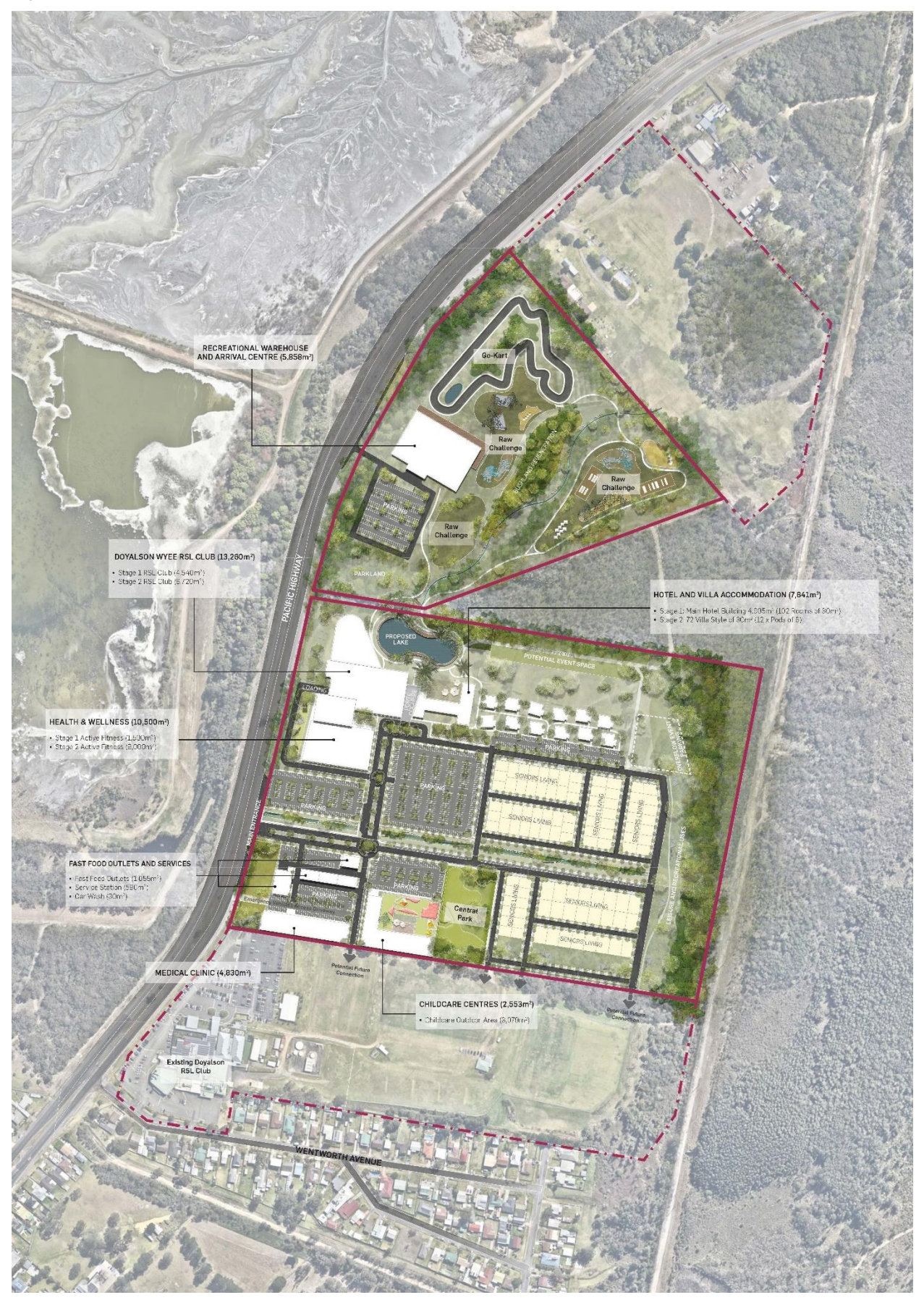
Figure 1 – Indicative concept plan