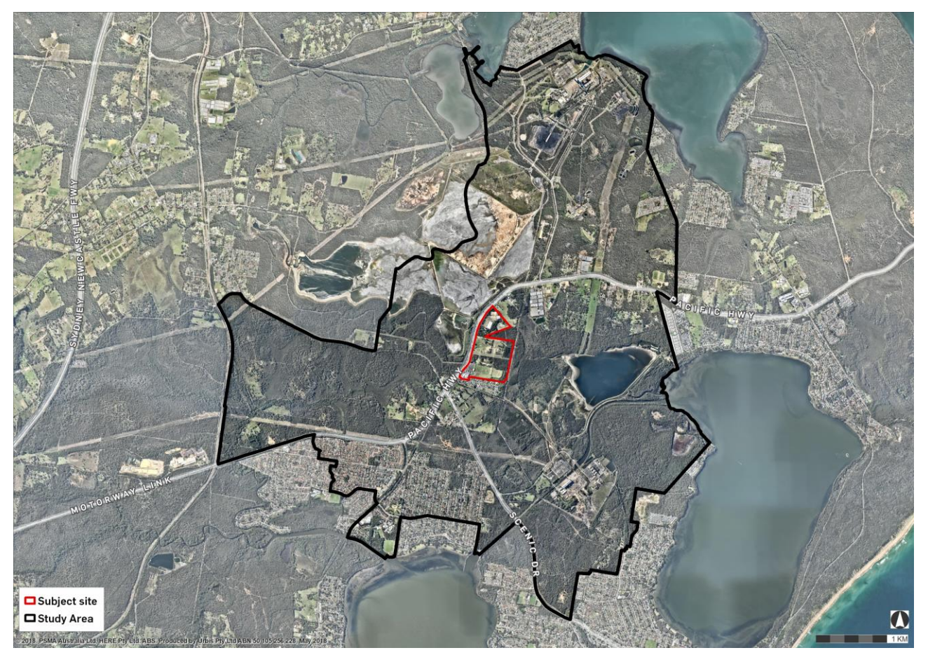
Figure 4 – Study Area

In 2016, the study area had a population of 6,540 people. Key characteristics of the study area's population are: